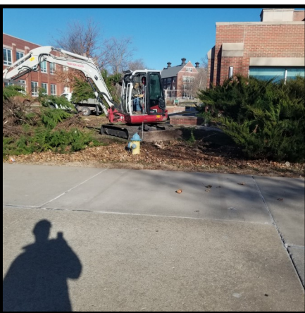
Landscape installing sidewalk between playground and stadium